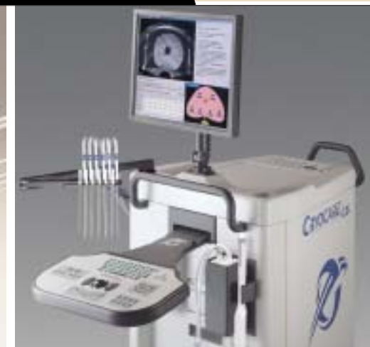
Image - Place - Treat - Cryocare CS provides it all